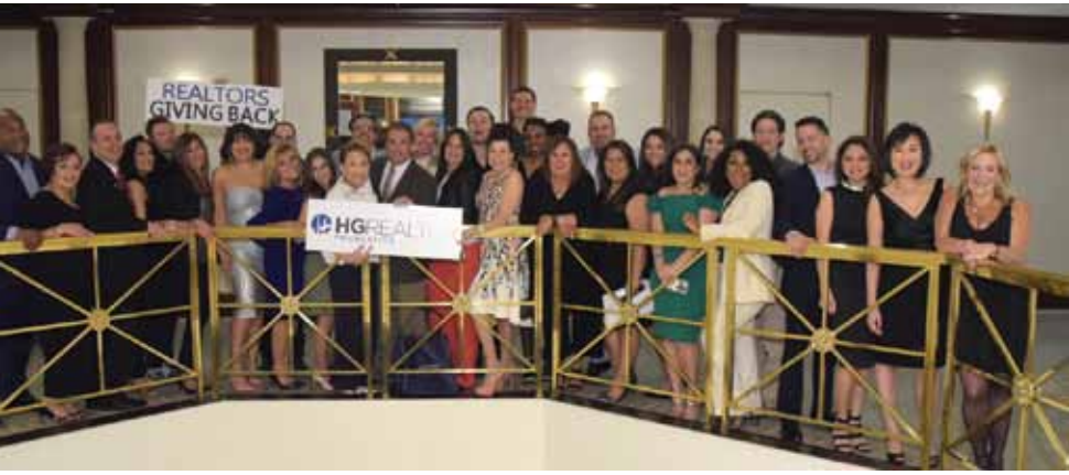
HG Realtor Foundation Committee at "Runway for Hope" Fashion Show.