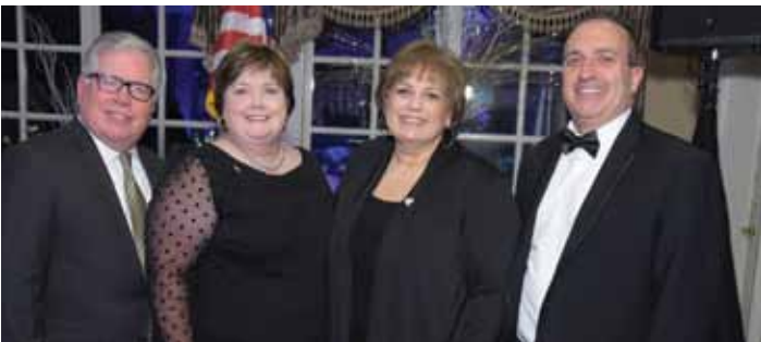
The 2019 Installation Gala was held at the Falkirk Country Club in Orange County

Important DOS Changes Regarding Continuing Education and Licensing: The amendment changes the course requirements for renewal. Effective July 1, 2021 all licensees will be required to successfully complete 22.5 hours of approved continuing education. The education must include at least 2.5 hours on the subject of ethical business practices, at least 1 hour of legal matters, at least 3 hours of fair housing and/or discrimination in the sale or rental of real property or an interest in real property and at least 1 hour of agency except in the case of the initial two-year licensing term for real estate salespersons, 2 hours of agency must be completed. The amendment also requires all brokers who are currently exempt from 22.5 hours of CE to take 22.5 hours of CE. This becomes effective July 1, 2021.