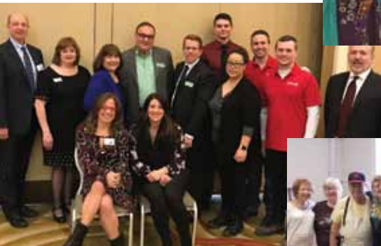
affiliate Members at Broker Owner event.