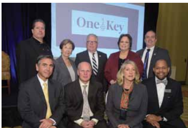
Broker Owner Manager meeting on OneKey MLS.