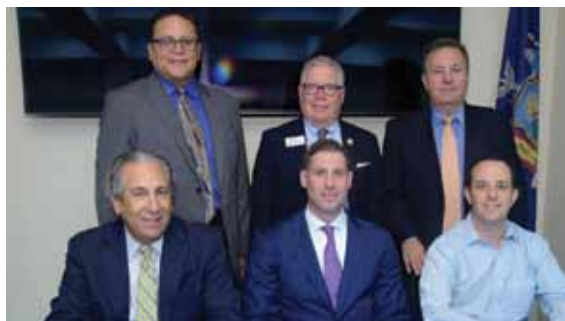
CID Breakfast seminar at the Hutchinson Metro Center in the Bronx.