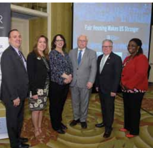
Fair Housing event