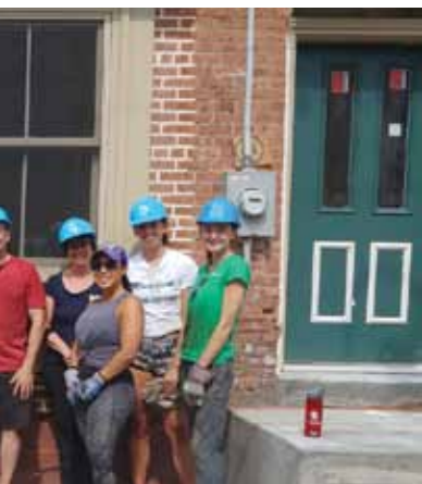
Greater Newburgh Humane Society