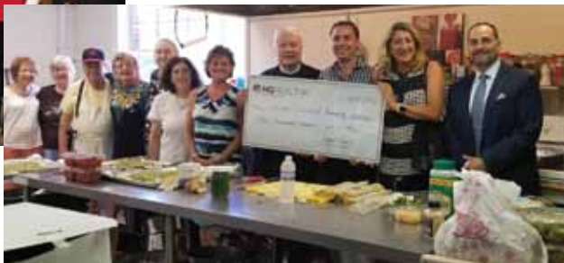
HG Realtor Foundation check presentation to Christ Church of Ramapo.