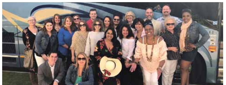
RPAC Wine Tour