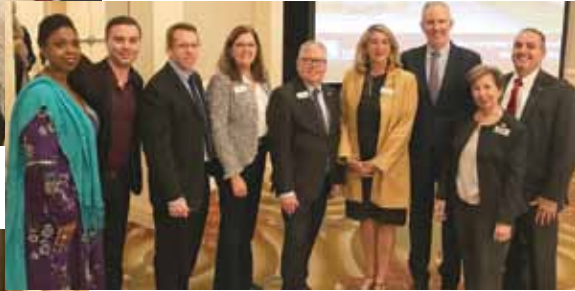
Members Day RPAC Luncheon