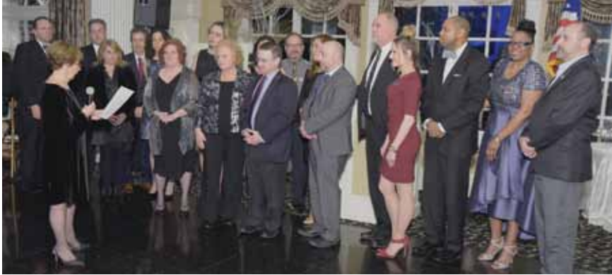
2019 HGAR Board of Directors