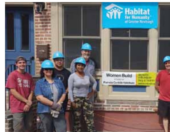
HG Realtor Foundation volunteers at Habitat for