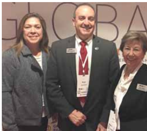
Global Real Estate Summit in NYC